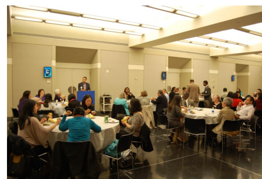
Luncheon networking session.